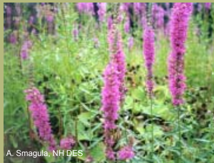
A. Smagula, NH DES