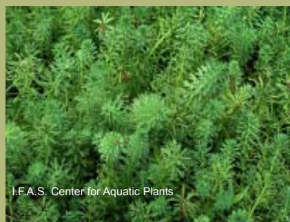
I.F.A.S. Center for Aquatic Plants