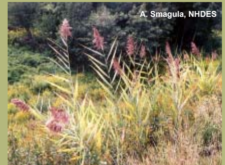
A. Smagula, NHDES