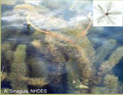
A. Smagula, NHDES