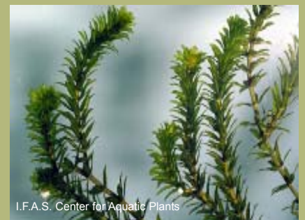
I.F.A.S. Center for Aquatic Plants