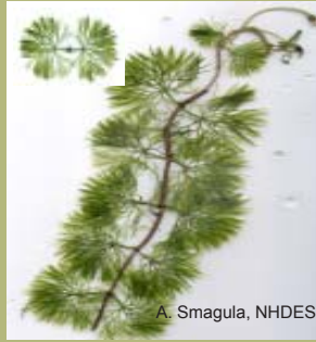
A. Smagula, NHDES